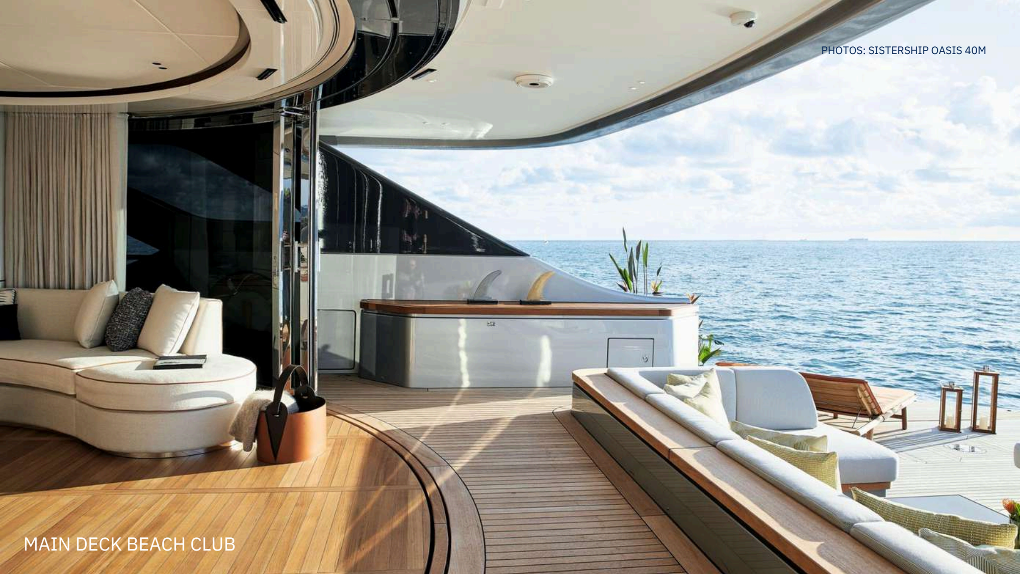
MAIN DECK BEACH CLUB