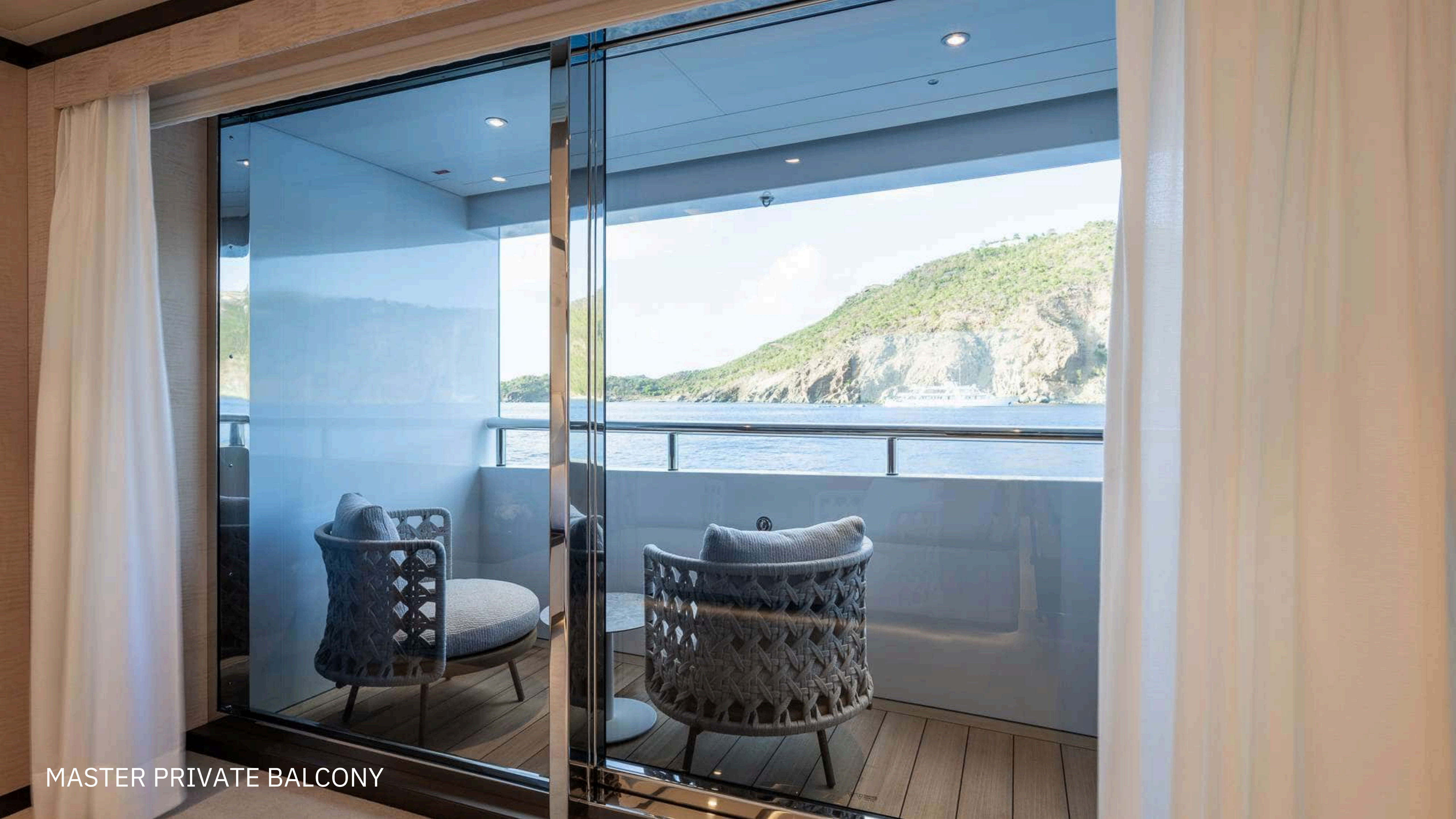
MASTER PRIVATE BALCONY