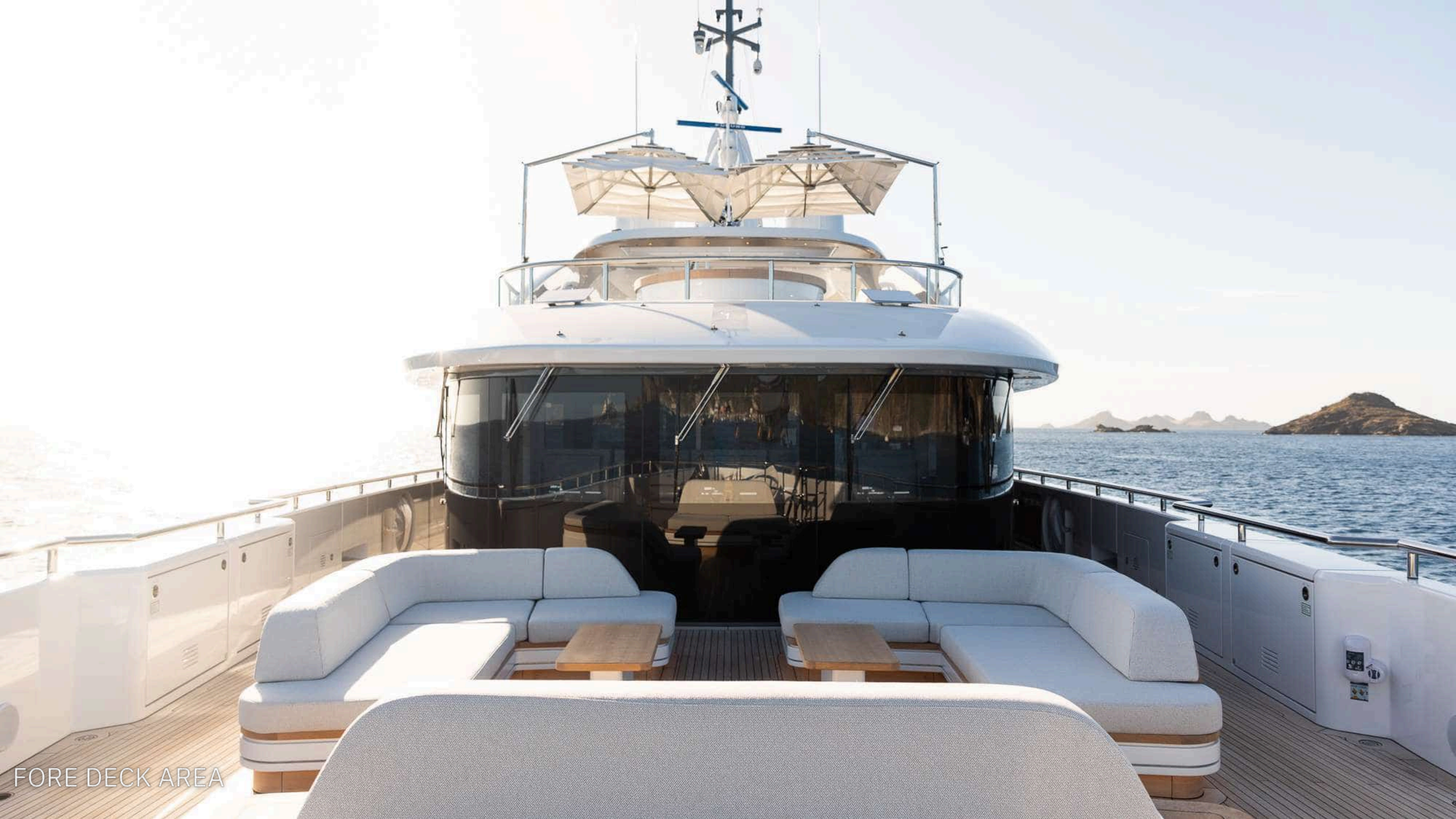
FORE DECK AREA