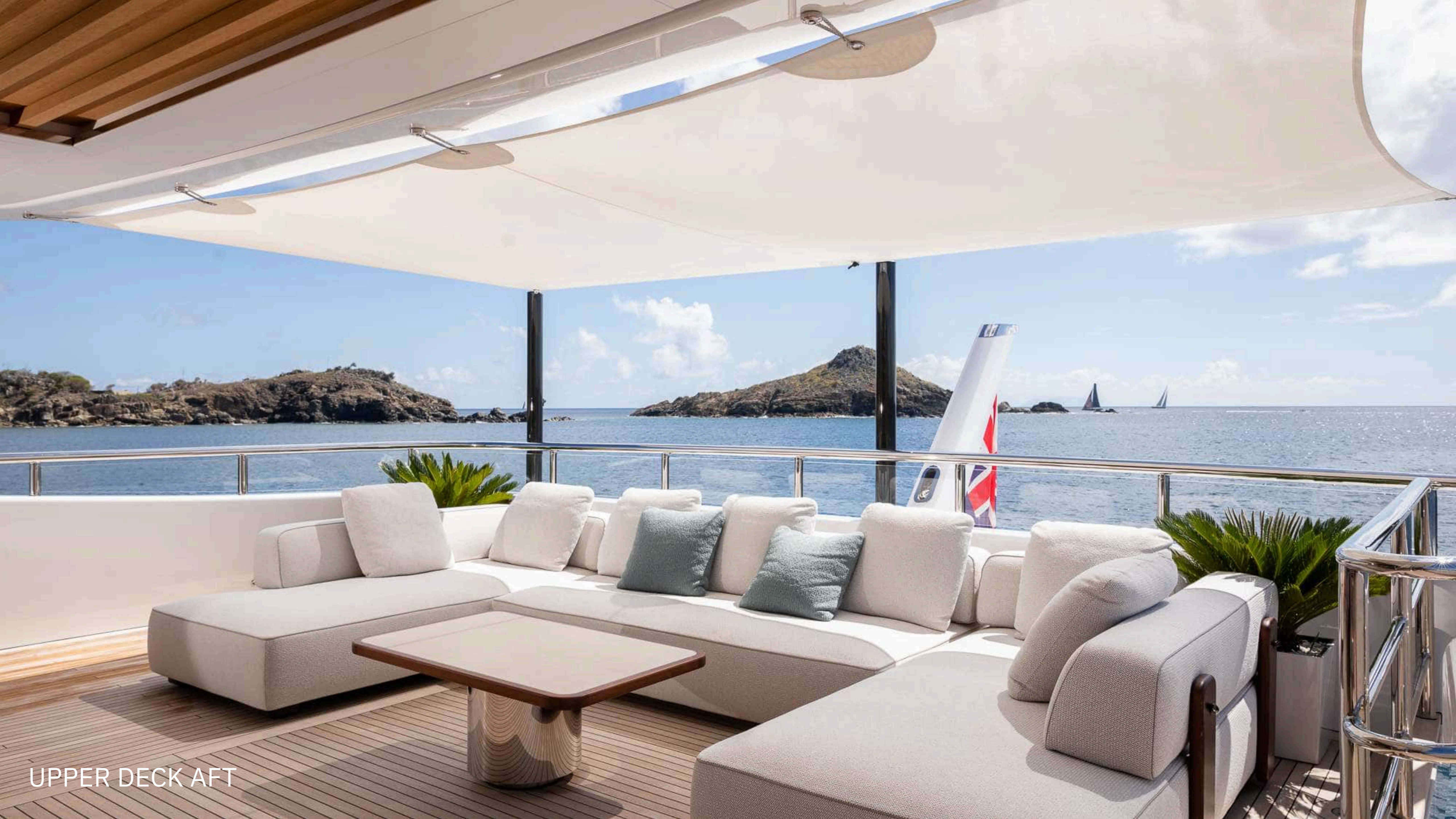
UPPER DECK AFT