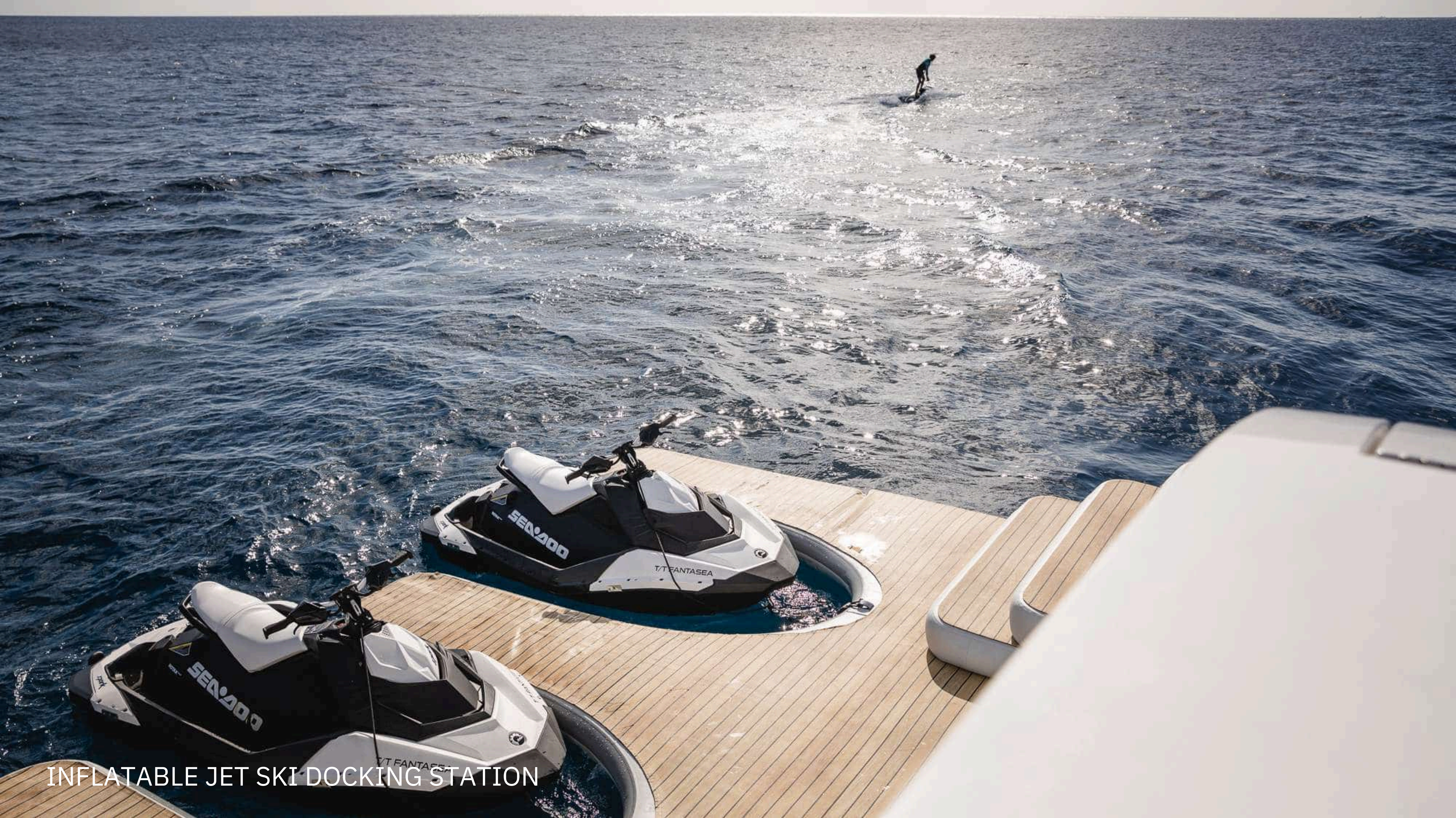
INFLATABLE JET SKI DOCKING STATION