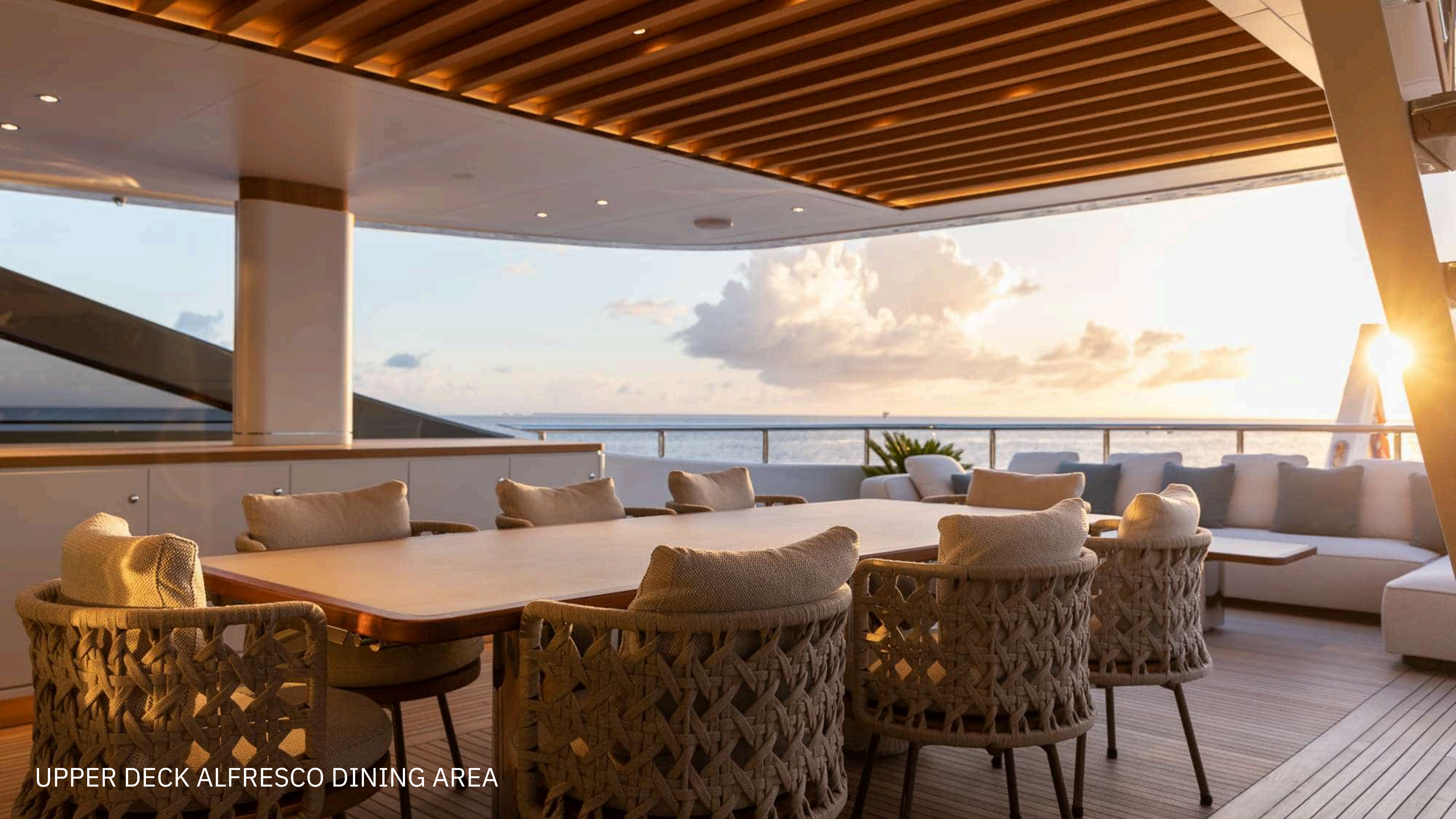
UPPER DECK ALFRESCO DINING AREA