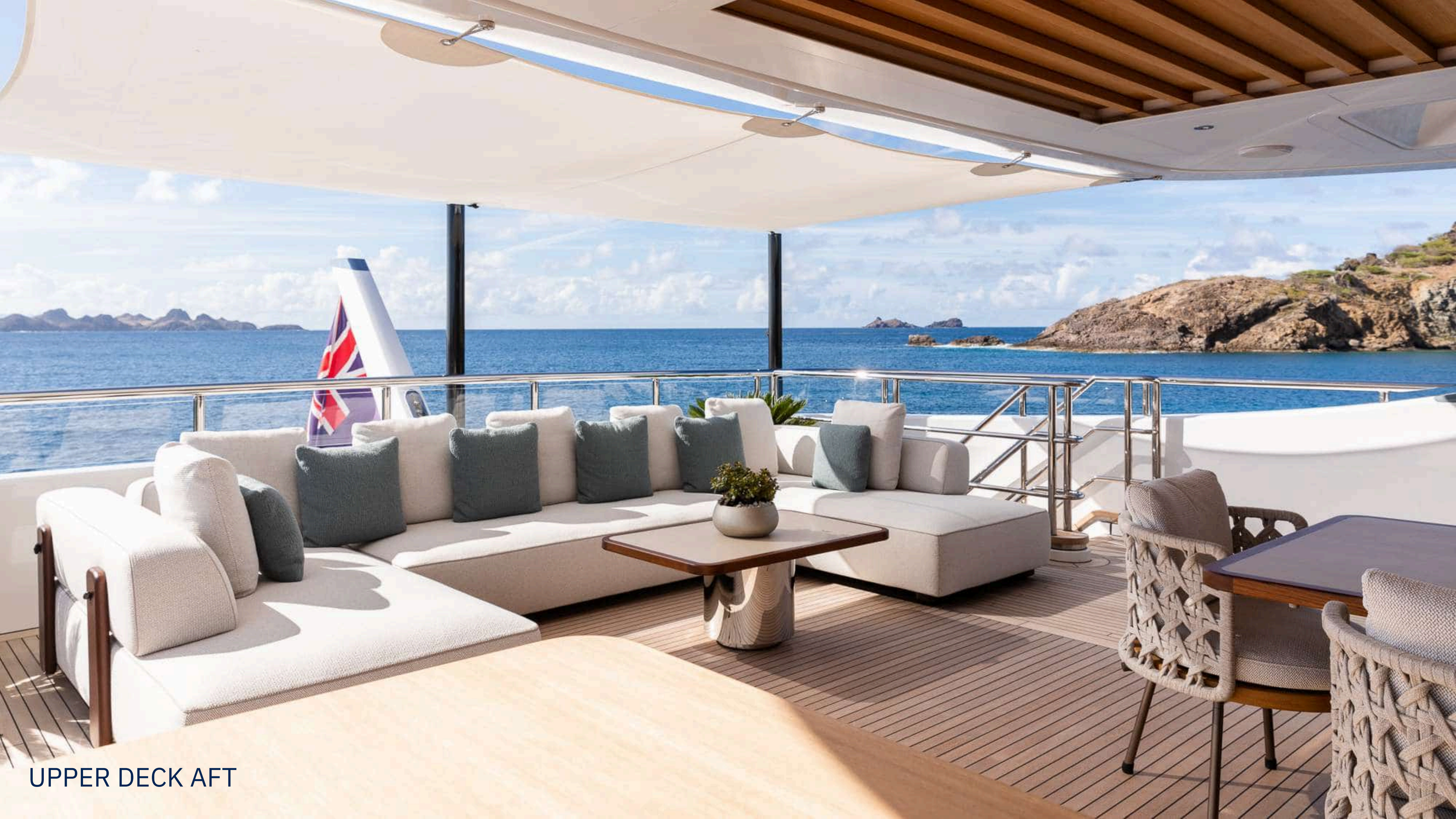
UPPER DECK AFT